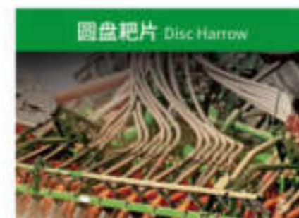
圆盘耙片 Disc Harrow