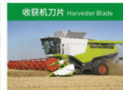
收获机刀片 Harvester Blade