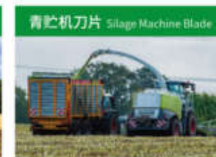
青贮机刀片 Silage Machine Blade