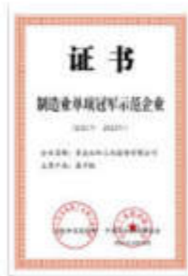
2021年获得国家制造业单项冠军示范企业 2021 The National Manufacturing Individual Champion Demonstration Enterprise