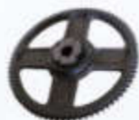
铸造链轮 Casting Sprocket