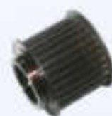
同步带轮 Synchronous Pulley