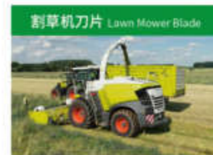
割草机刀片 Lawn Mower Blade