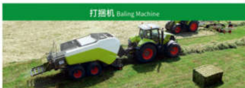
打捆机 Baling Machine