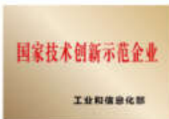
2017年获得行业首批国家技术创新示范企业 2017 The First Batch of National Technology Innovation Demonstration Enterprise

Now, CHOHO's leading product has advanced international level. CHOHO is responsible for several nationally significant research and development projects, has amended 24 national or industrial standard, and obtained more than 220 national invention and new model patents. CHOHO has performed the role of leading and instructing in the technology development of this industry.