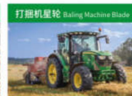
打捆机星轮 Baling Machine Blade