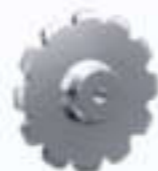
双节距链轮 Double Pitch Sprocket