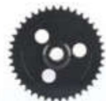
锥键槽链轮 Cone Keyway Sprocket