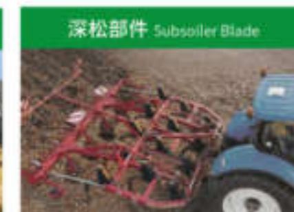
深松部件 Subsoiler Blade