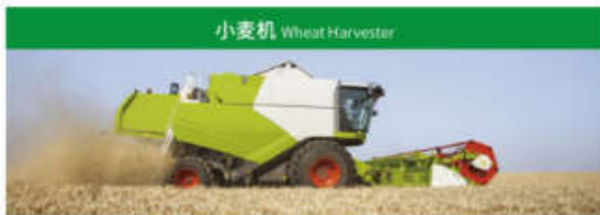
小麦机 Wheat Harvester