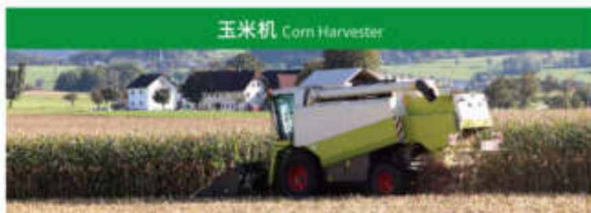
玉米机 Corn Harvester