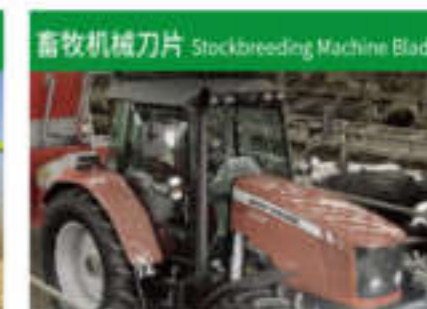
畜牧机械刀片 Stockbreeding Machine Blade