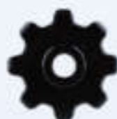
精锻链轮 Precision Forging Sprocket

更多产品信息可查阅证和《农机链轮手册》 More product information can be found in CHDHO "Agricultural Sprocket Manual"