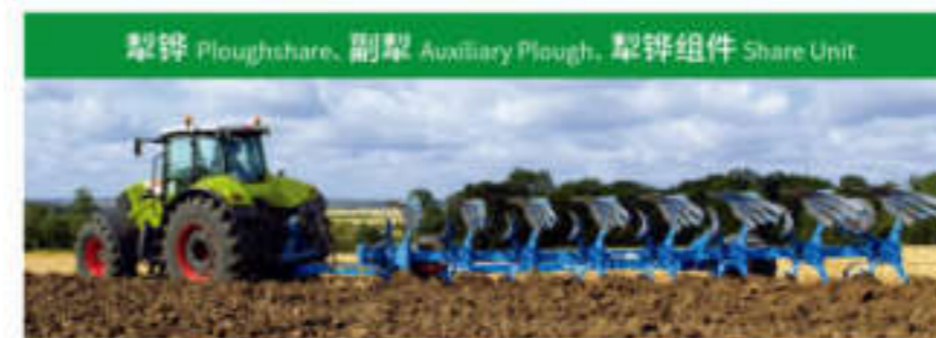
犁铧 Ploughshare, 副犁 Auxiliary Plough, 犁铧组件 Share Unit