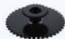
焊接链轮 Welding Sprocket