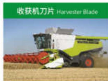
收获机刀片 Harvester Blade