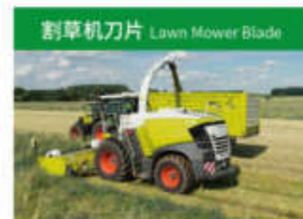
割草机刀片 Lawn Mower Blade