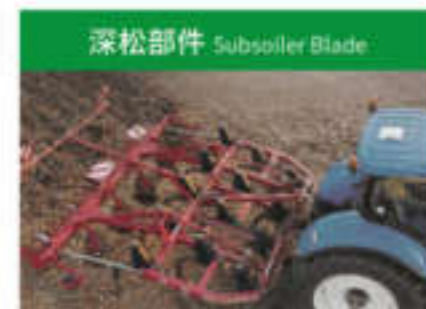
深松部件 Subsoiler Blade