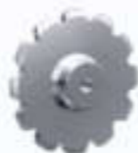
双节距链轮 Double Pitch Sprocket