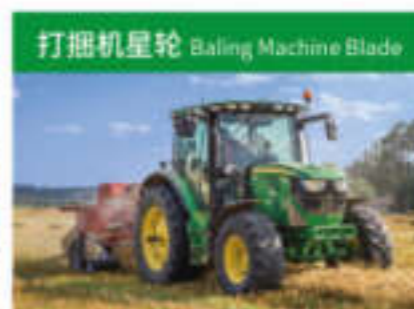
打捆机星轮 Baling Machine Blade