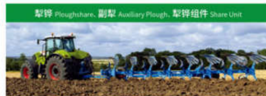
犁铧 Ploughshare, 副犁 Auxiliary Plough, 犁铧组件 Share Unit