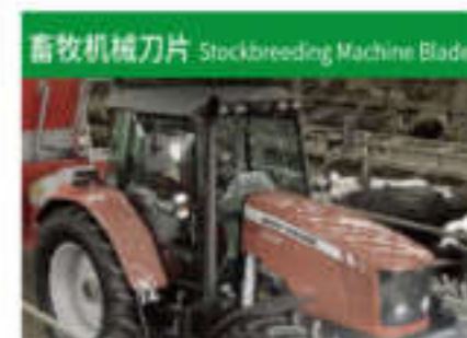
畜牧机械刀片 Stockbreeding Machine Blade