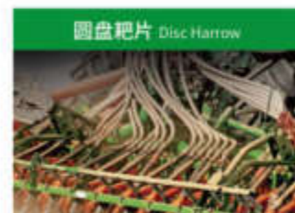
圆盘耙片 Disc Harrow