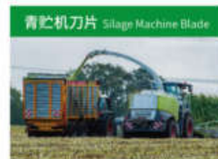
青贮机刀片 Silage Machine Blade