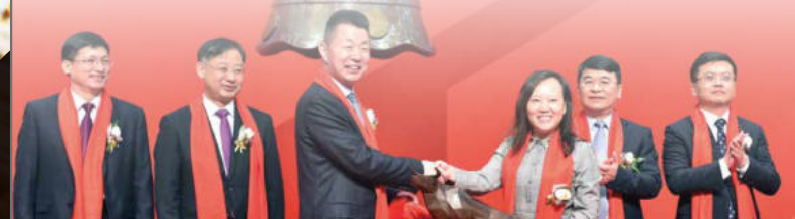
征和工业（浙江）有限公司 Qingdao Choho Industrial Co., Ltd.